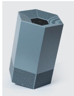
Sapphire blue REF. 8 77 2127-BL