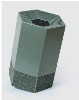
Malachite green REF. 8 77 2127-GR