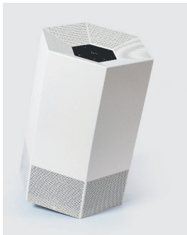
Cream white REF. 8 77 2127-WH