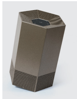
Bronze REF. 8 77 2127-BR