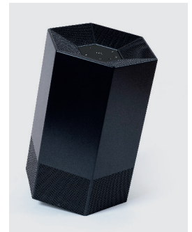
Matte black REF. 8 77 2127-BK